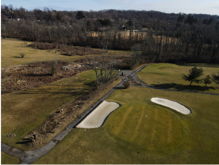
Trees behind 3 Green