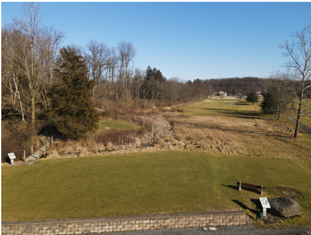
View looking up 18