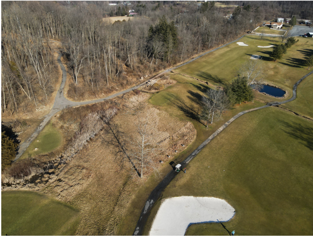
18 Tee trees cleaned up