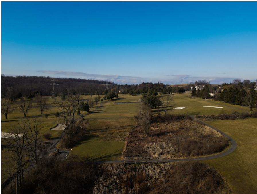
Vantage from 4 Tee looking up